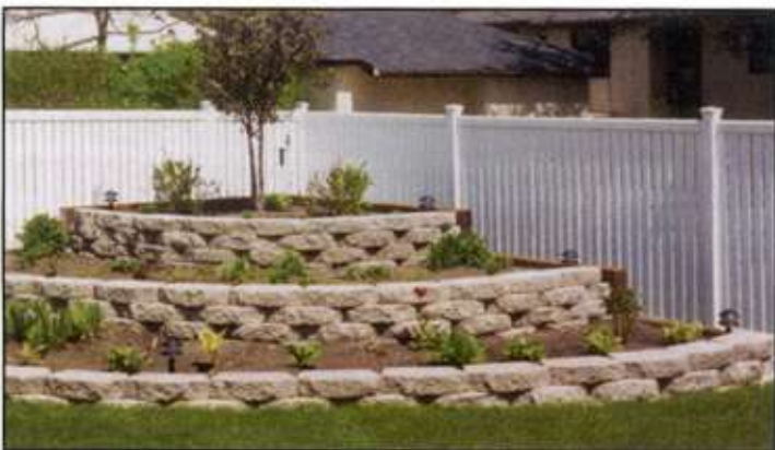
4' Tall or Under