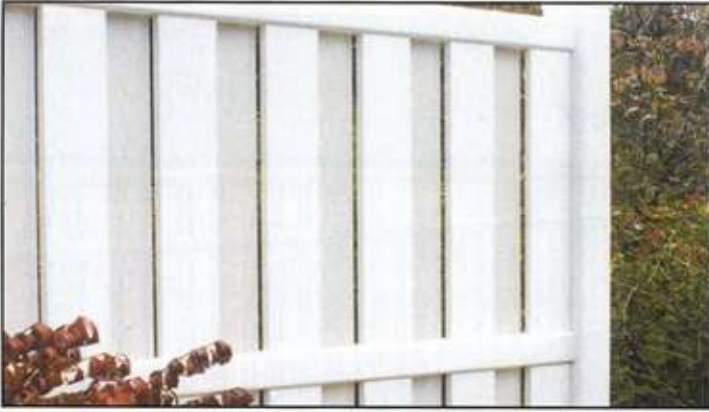
Vertical Shadow Box